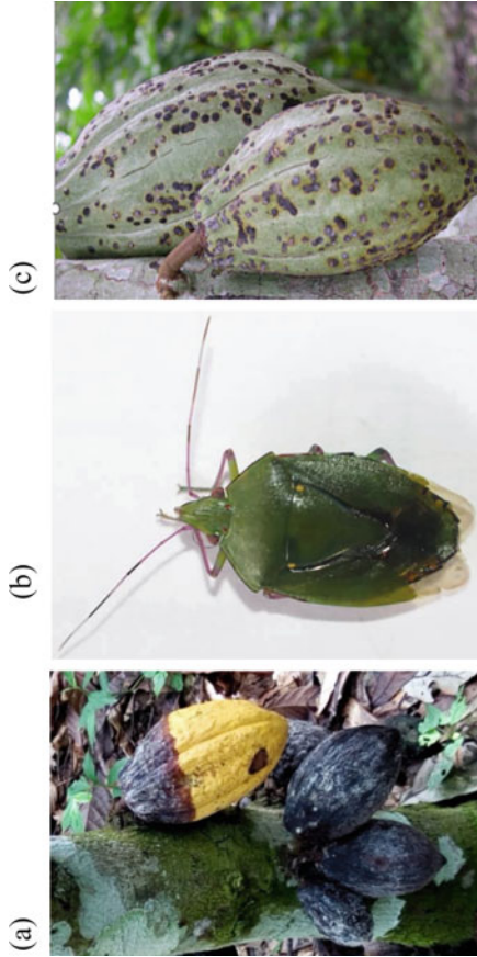
Fig. 3.2 Important biotic stressors in cocoa. (a) Pods infected by black pod disease (caused by Phytophthora sp.), (b) mirid insect ( Sahlbergella singularis ) and (c) damage symptoms of mirid infection on cocoa pods