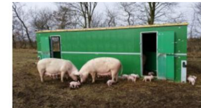
Fig. 1 and 2 – Farrowing huts from the Danish PPILOW partner firm Vanggård Staldmontage