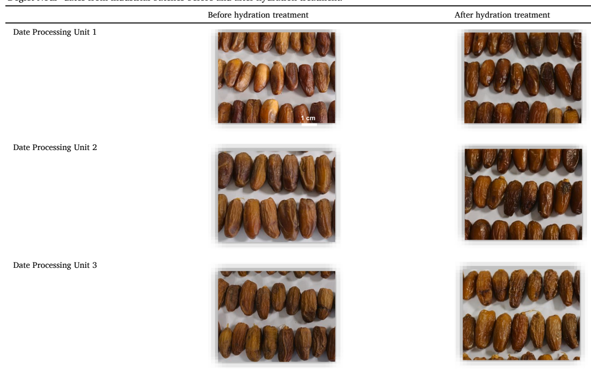
Table 1 'Deglet Nour' dates from industrial batches before and after hydration treatment.

Colour and firmness were measured on the whole fruits the day after their reception. Whole fruit firmness was determined at room temperature, as a compression force on the two flat sides of 10 fruits chosen as representative among the 18 sample lots using a texturometer (Texture