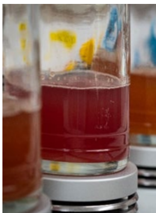
Figure 1.3. Pictures of the N 2 -fixing PNSB cultures.