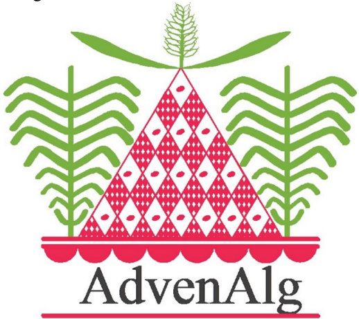
Figure 1. The AdvenAlg logotype is inspired by the decorative symbolism of Berber pottery and tapestry

These two information tools were developed on the basis of several years study of weeds and agricultral system in the Oranian phytogeographic region (Kazi Tani, 2011). This region was chosen for high floristic Mediteranean diversity and the fact that the edaphic, bioclimatic and agronomic conditions are representative of the whole Algerian Mediterranean region.