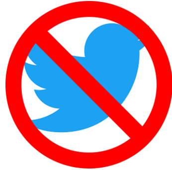
41 billion euro