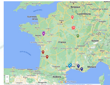
Figure 2: National vineyard network

We set up a network of 14 commercial plots spread across the six main French wine-regions (Figures 1 and 2). Plots were selected on their environmental performance only so that they covered a wide diversity of production contexts.