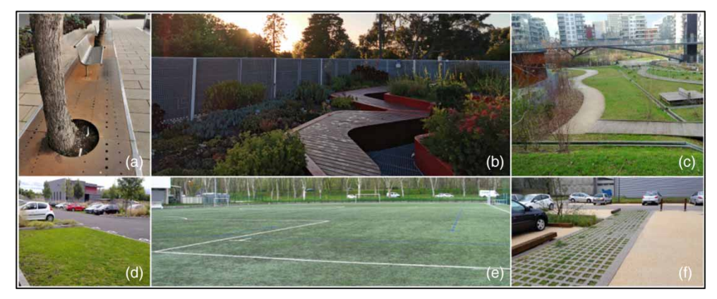
Figure 2 | Example of stormwater management infrastructure where the main function is not related to water management: (a) street furniture (Melbourne, Australia), (b) roof (Burnley, Australia), (c) public park (Paris, France), (d) parking lot (Villeurbanne, France), (e) soccer field (Villeurbanne, France), and (f) pedestrian or cycle path (Villeurbanne, France).

Some efforts can be reported regarding other aspects than hydraulic and treatment performance. Several authors have considered cost-effectiveness via a cost analysis (Taylor 2003; Lee et al. 2010; Li et al. 2021). Duffy et al. (2008) conclude that SUDS are more cost-effective based on a whole-life costing analysed than traditional sewers. A relatively popular theme are environmental aspects such as the heat island effect and air quality (Norton et al. 2015; Zölch et al. 2016; Jayasooriya et al. 2017; Bartesaghi Koc et al. 2018; Saaroni et al. 2018), where urban green infrastructures are demonstrated to contribute to urban heat mitigation. Bianchini