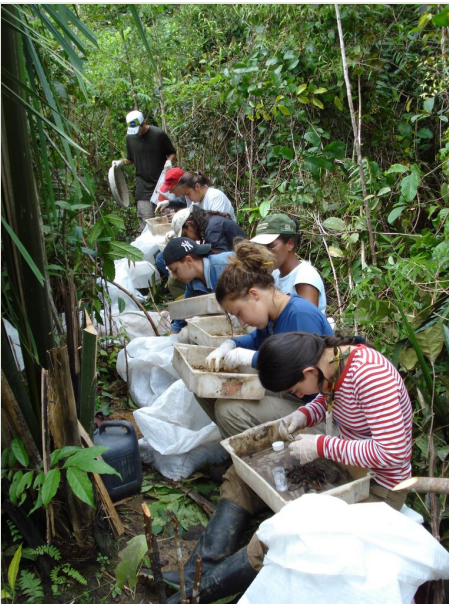
Figure 5. doi

Isolation of a TSBF monolith, in which the sample is removed without digging around the hole. This is more effective when only the top 0-10 cm or, at most, the 0-20 cm layer is going to be sampled and handsorted.