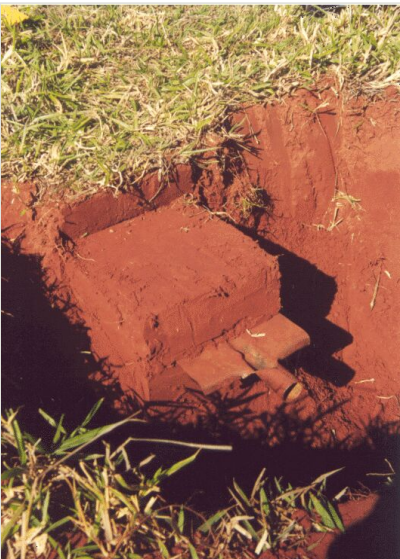
Figure 3. doi

An example of a modification of the TSBF soil monolith sample from a semi-deciduous tropical forest, where an "L"-shaped hole is dug in front of the monolith to facilitate the removal of the soil layers of different depth increments. The quadrat on top has an internal area of 25 x 25 cm, which is used to mark the area from which the surface litter (when present) is removed for handsorting of the surface-dwelling macroinvertebrates.