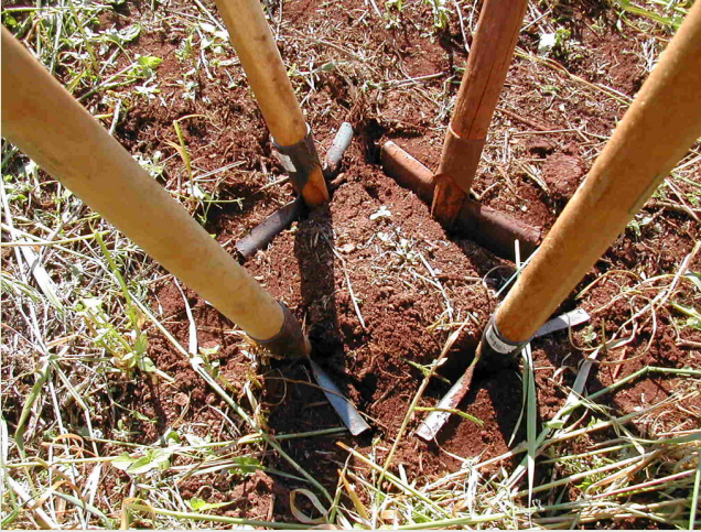
Figure 4. doi

Isolation of a TSBF monolith, in which the sample is removed without digging around the hole. This is more effective when only the top 0-10 cm or, at most, the 0-20 cm layer is going to be sampled and handsorted.