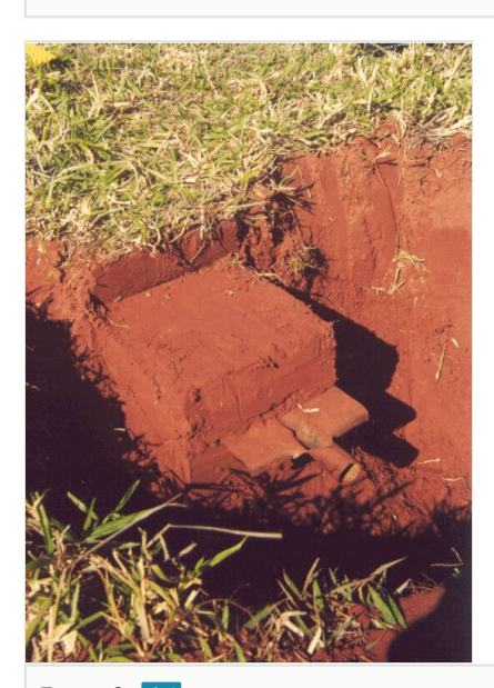
Figure 3. doi

An example of a modification of the TSBF soil monolith sample from a semi-deciduous tropical forest, where an "L"-shaped hole is dug in front of the monolith to facilitate the removal of the soil layers of different depth increments. The quadrat on top has an internal area of 25 \times 25 cm, which is used to mark the area from which the surface litter (when present) is removed for handsorting of the surface-dwelling macroinvertebrates.