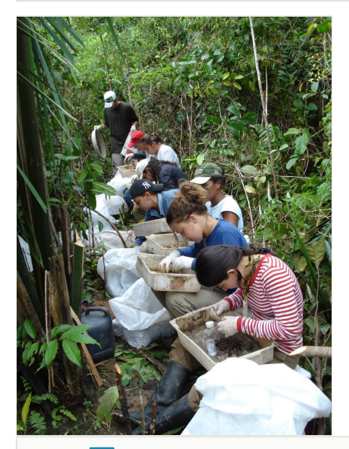
Figure 5. doi

Isolation of a TSBF monolith, in which the sample is removed without digging around the hole. This is more effective when only the top 0-10 cm or, at most, the 0-20 cm layer is going to be sampled and handsorted.