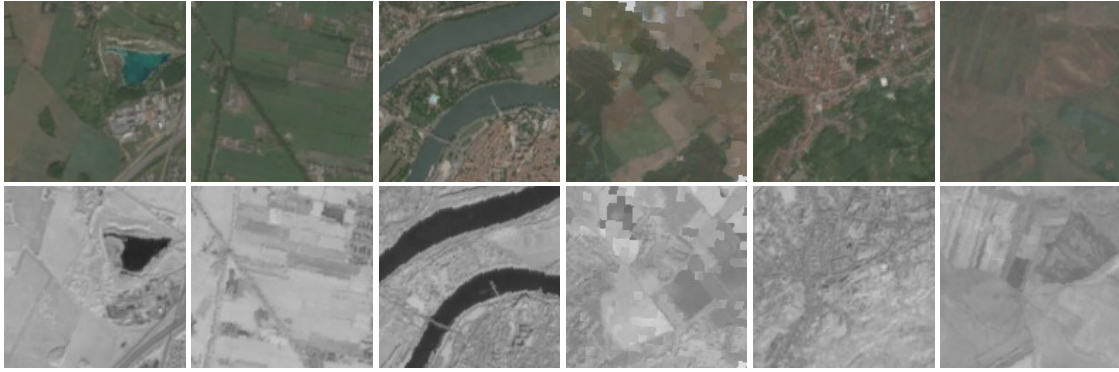
Figure 2: Sentinel-2 satellite images. First row RGB. Second row Near-Infrared (NIR).