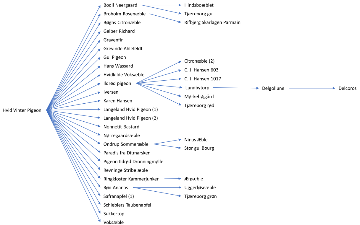
Fig. 2 Descendants of ‘Hvid Vinter Pigeon’ revealed among the 667 unique genotypic profiles. The arrows point from parent to offspring