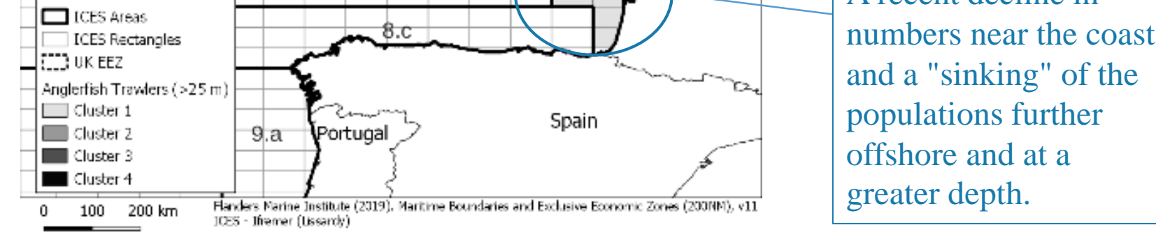
Figure 3: spatial distribution of clusters regarding trawlers over 25 m with identification of areas included in waters under British jurisdiction following the Brexit.

ICES with catches areas =>The intersecting with the new exclusive economic zones of the UK are 7j, 7h and