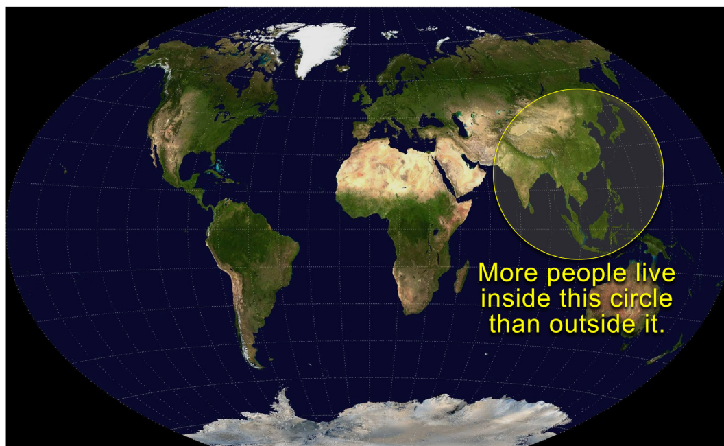
Fig. 2. The Valenepieris circle. More people live inside this circle than outside NASA, Valerie Pieris, cmglee, CC BY-SA 4.0, via Wikimedia Commons.